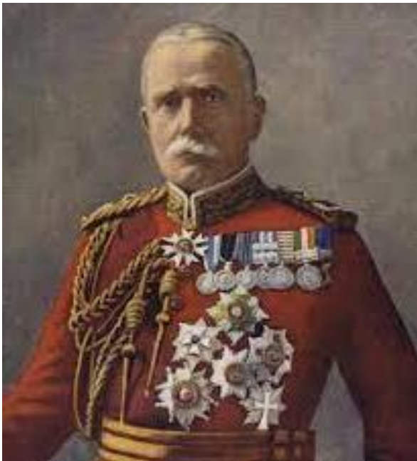
Picture: Field-Marshal French

French pursued the Boers to Barberton and entered the town early in September 1900 where he captured a number of engines, wagons and supplies. With President Kruger having left the country for exile, the British believed the war to be nearing its end, and French was put in command of the Johannesburg area.