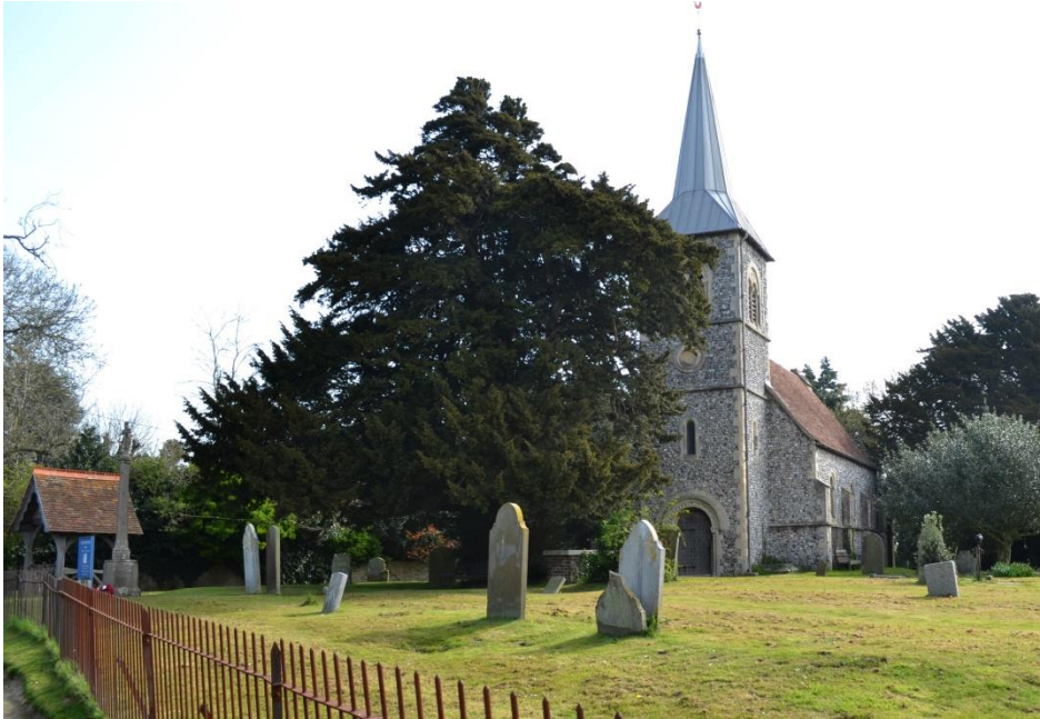
Picture: St. Mary the Virgin Church at Ripple

The procedure of burying ashes in an urn was still unfamiliar at the time, and it was transported in a coffin during the funeral ceremonies.