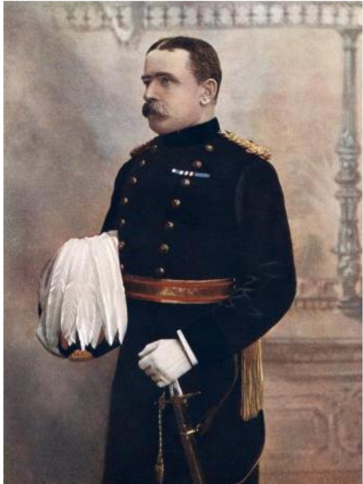
Picture: Field-Marshal French

In the period between the appointment of General Roberts as Commander-in-Chief on 17 December 1899, and his subsequent arrival in Cape Town on 10 January 1900, French was the only senior British Commander to conduct active operations in the theatre of war. Early in February 1900, French was given the command of forces to relieve Kimberley, which he did on 16 February, receiving accolades from both Roberts and Queen Victoria.