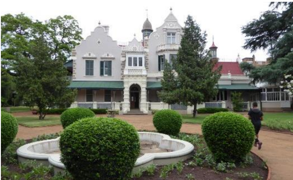
Picture: Melrose House – the venue for the signing of the Treaty of Vereeniging

On 27 May 1902, the British Cabinet met to discuss the final terms of the treaty and on 28 May the Boers were presented with the terms and given three days to make a decision, the answer required was either yes or no. 60 Boer delegates met in Vereeniging to debate the terms of the treaty. Discussions were heated with the Free State delegates being in favour on carrying on with the war. At around 2 pm on 31 May a vote was called and 54 delegates voted yes to the terms of the treaty and six voted no. On the same day, just before midnight, the Boer leaders returned to Kitchener at Melrose House in Pretoria, and the peace treaty was signed.