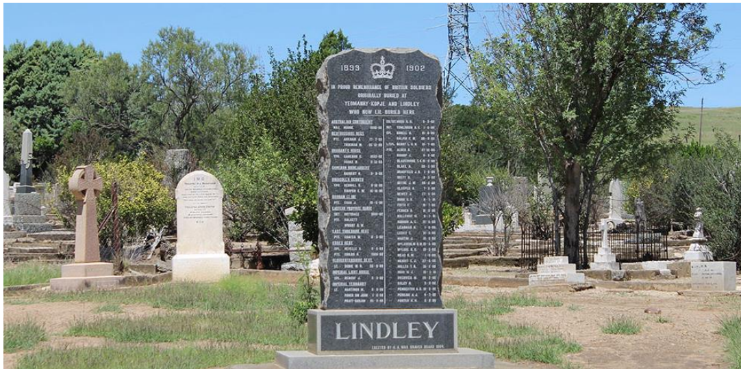
Picture: Garden of Remembrance to the Battle of Lindley

May 1900 : After regrouping and re-equipping his forces, General Roberts started his advance to the Transvaal. He had been forced to spend time in Bloemfontein as an outbreak of dysentery and enteric fever had severely affected the health of his troops. Also, Lieutenant-General French's cavalry division was in dire need of horses. The Boers, having suffered the ignominy of Cronje's capture, and a number of reversals, such as the Relief of both Ladysmith and Kimberley, were making the British progress as difficult as possible – bridges and railway infrastructure were destroyed as part of this strategy. In the Free State the Battle of Lindley (the battle of the month on the website – www.battletoursza.com ), was a huge embarrassment to the British, and Major-General Colville was criticised for his performance, and relieved of his command.