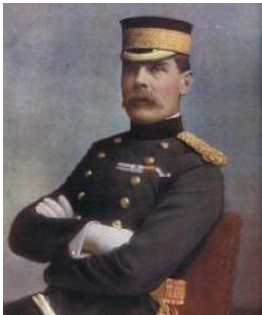
Picture: Lord Methuen

The following day Methuen, having not made as much progress as he would have liked due to Boer activity at the rear of his column, decided to camp on the farm Tweebosch. Early on the morning of 7 March Methuen divided his column into three, with the wagon convoy leaving the camp first. At first light the Boers attacked Methuen’s rear-guard.