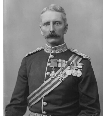
Picture: General Woodgate

During two of the March months of the South African War (1900 & 1901), seven V.C.s were awarded: