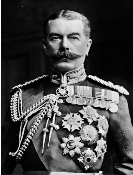
Picture: Lord Kitchener

peace and Kitchener commenced with the barbed wire and block house campaign to try and thwart guerrilla attacks by the Boers.