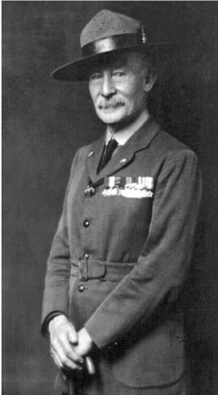
Picture: Lord Baden-Powell

Lieutenant-General Robert Stephenson Smyth Baden-Powell was born in London on 22 February 1857. He was educated at Charterhouse School and on joining the British Army he saw service in India and Africa, from 1876 until 1910. During the South African War (1899-1902) he successfully defended the town of Mafeking during its 217 day siege.