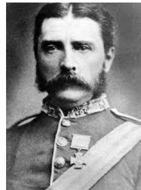
Picture: Lieutenant Gronville Bromhead

During the two August months of the Anglo Boer War (1900 & 1901), seven V.C.s were awarded: