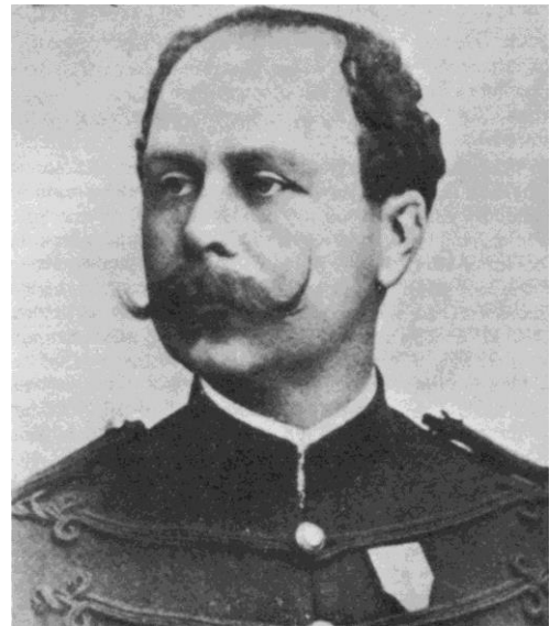
Picture: French General Villebois-Mareuil

He, with his 'foreign' commando were on their way to destroy the railway line south of Kimberley.