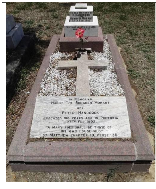
Picture: The communal grave of Lieutenants Morant and Handcock – recently restored by the Australian Government

Wikipedia records the following – "Lieutenants Harry 'Breaker' Morant and Peter Handcock were serving with the Bushveld Carbineers when they were court martialled. They were executed on 27 February 1902 by a firing squad of Cameron Highlanders, having been convicted by the British army of murdering a civilian, and Boer prisoners of war. Morant claimed that the BVC had been ordered not to take prisoners. Lieutenant George Witton, who had been sentenced to death by the same court-martial but whose sentence was later commuted to life imprisonment, was released following a public outcry; he had served 32 months."