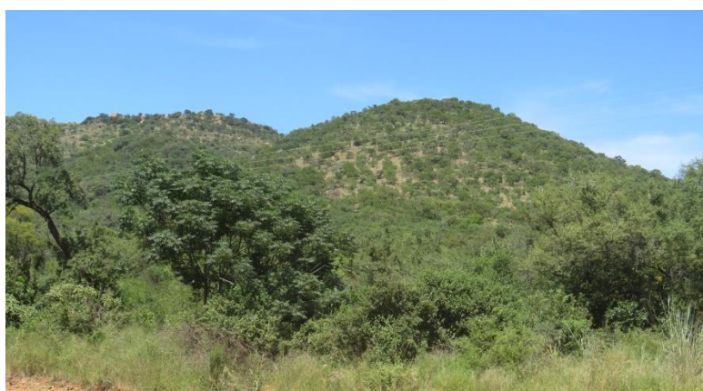
A view of the hill on the south side of the road from which the British fired on Smuts and the Boers who were trying to over-power the guns