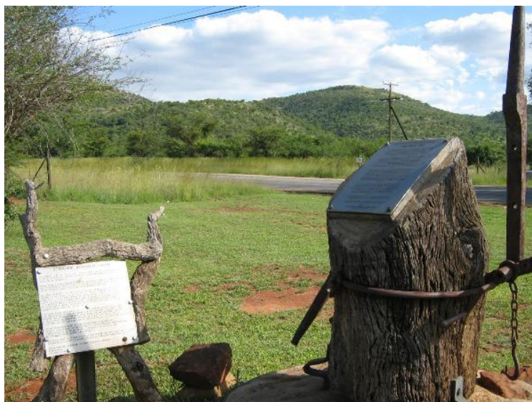
Memorial to the Boers killed at the Battle of Buffelspoort

I have a number of bookings for 28 March, and those who would like to join us, please get in touch and I will supply details. For those not in the Johannesburg area (either in South Africa or overseas), when travel opens up, and you are in Johannesburg on business or pleasure and have a free day, please make contact and a trip will be arranged.