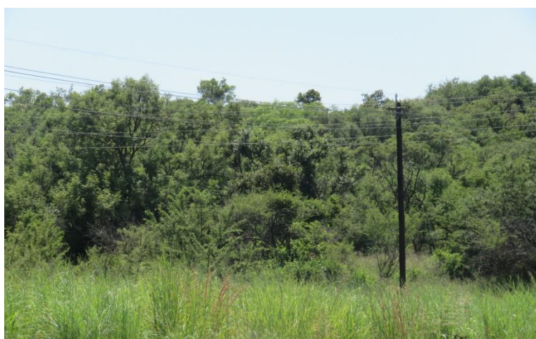
View of the donga, or dry river bed, which is now overgrown with trees and greenery

There is still a dry river bed, now covered with trees and other greenery, visible about 500 metres before the entrance to the hills. What had been identified to me, some 18 months ago, as the hill on which the guns had been placed is about 2 km down the road and there is no evidence of a donga along the road, other than the one as indicated above, some distance away – certainly not the distance Smuts had spoken about.