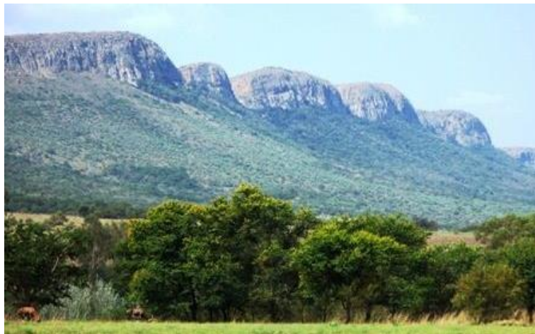
The magnificent Magaliesberg Mountains