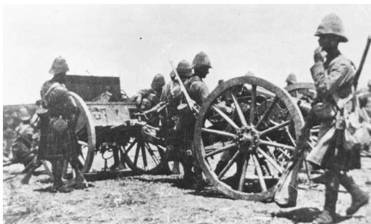
British Artillery Soldiers